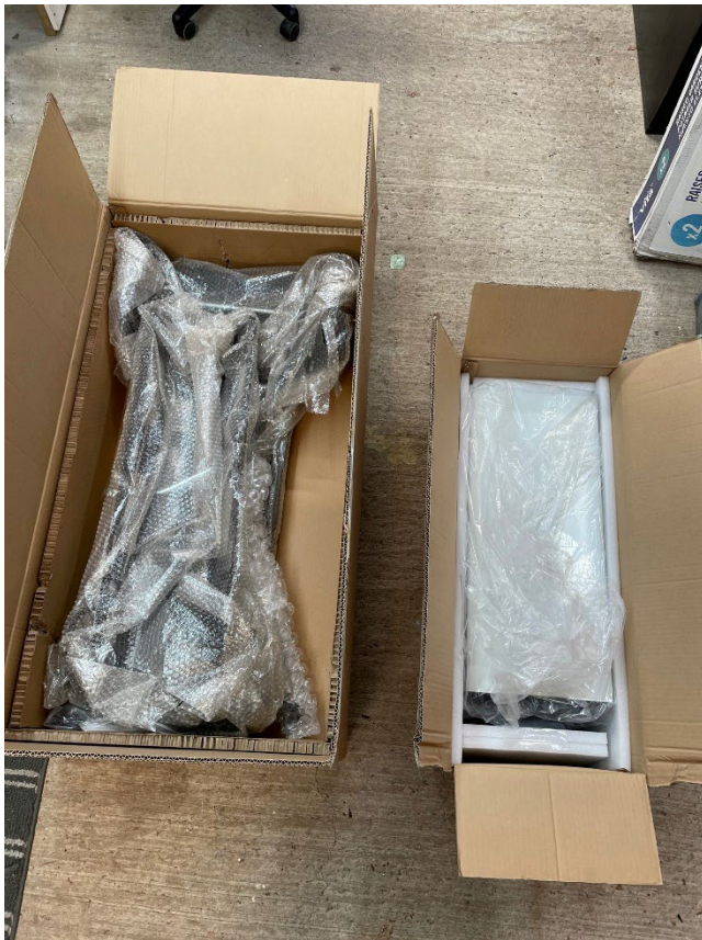
As Shipped contents.