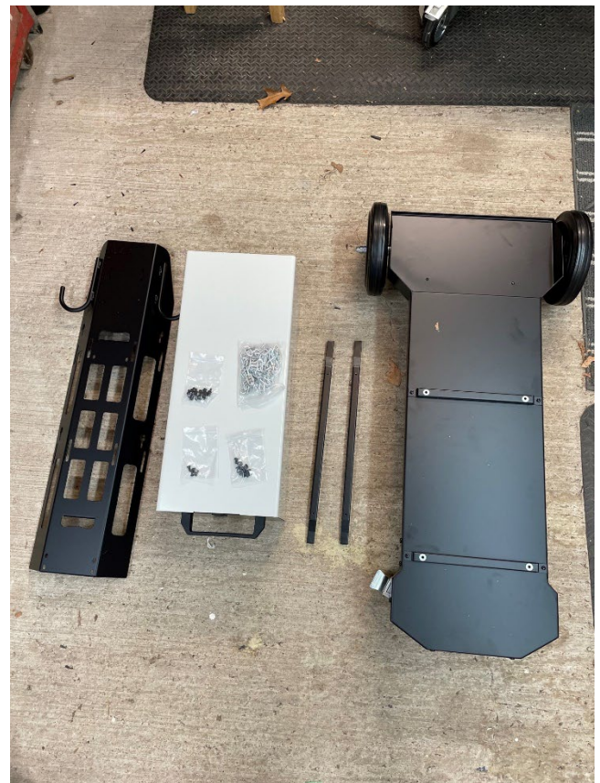
Contents unpacked. Power Supply Fixing Bars not shown.