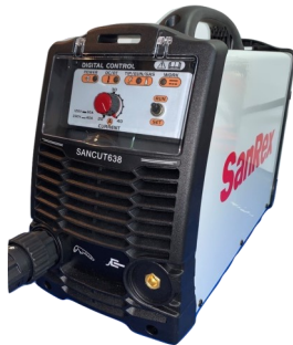
Sancut 638 (More Information)