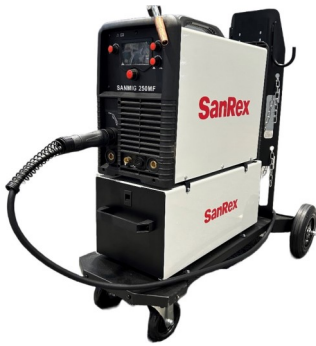
250MF Cart (More Information)