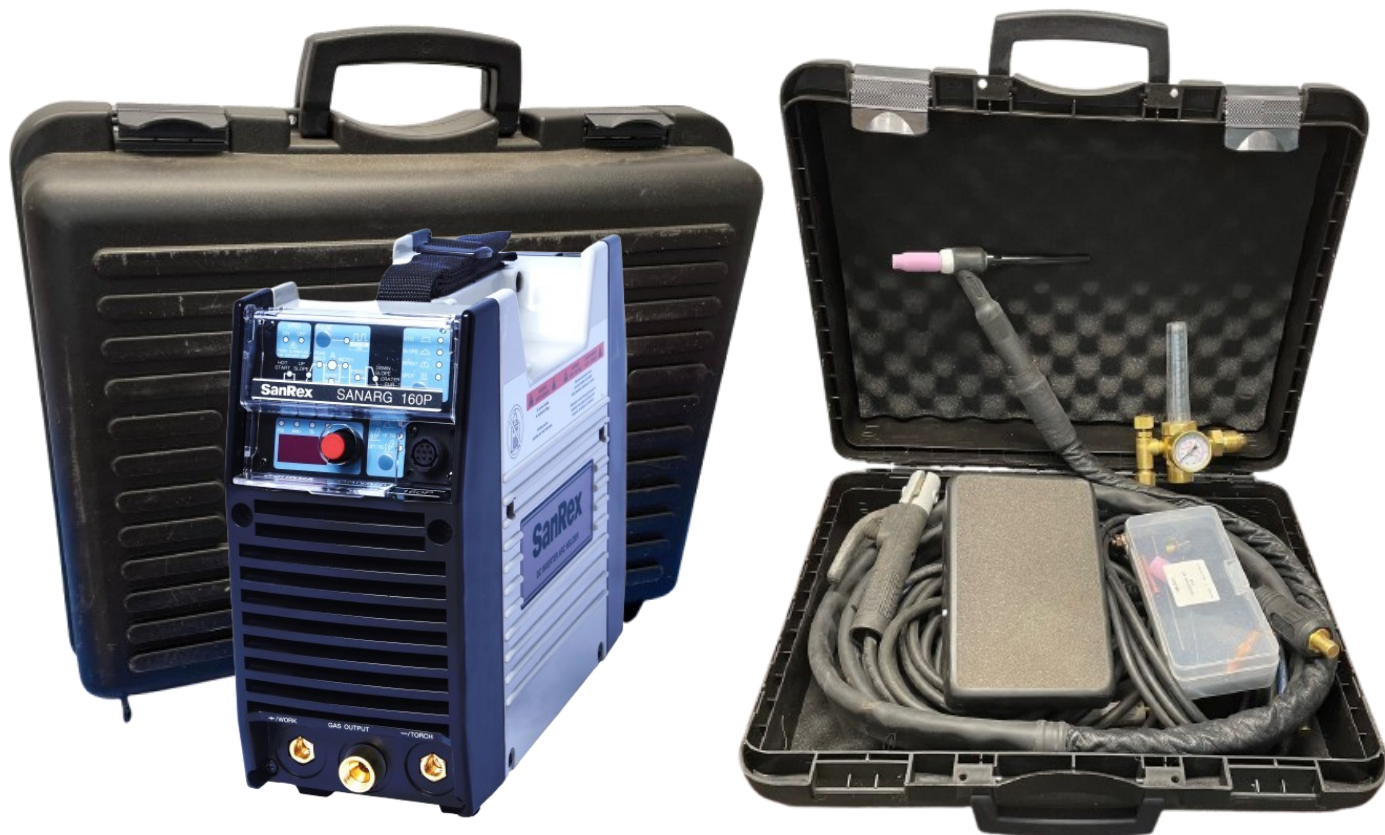
160P-ACTK Air-Cooled TIG Package shown.