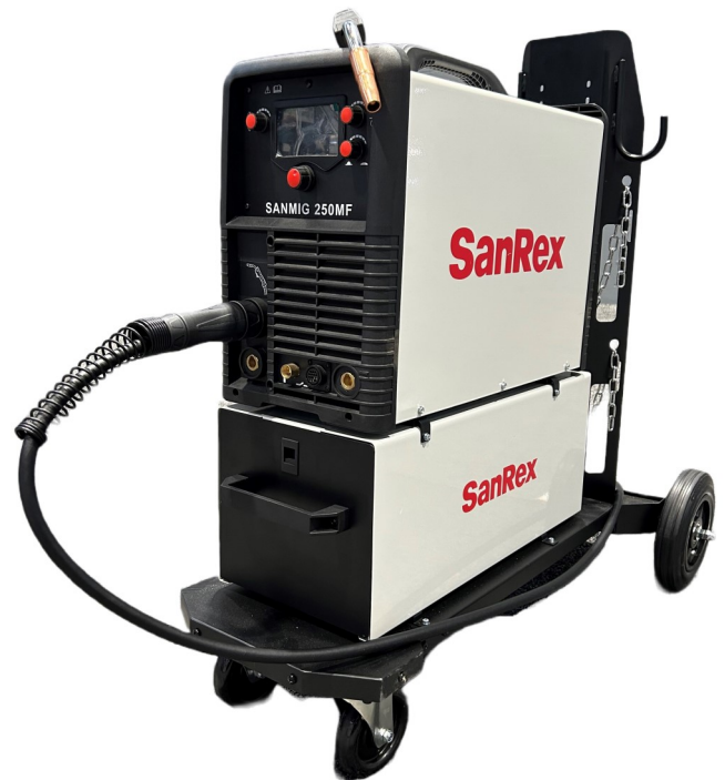
SANMIG 250MF Pkg with Cart.