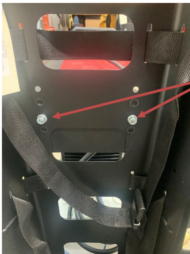
Allen 6mm Bolts